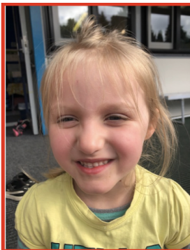
Winter - Room 1